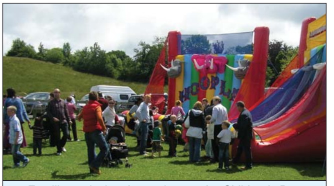
Families enjoying themselves at the Children's Day

On Sunday the 6th of July Leitrim County Childcare Committee hosted a Children's Day in Drumshanbo from 1pm to 4pm at Acres Lake Amenity on the Carrick Road. This was a free event offering a variety of activities for families and children of all age groups. Activities on the day included an inflatable slide, penalty shoot out and basketball target. There was also a DJ and face painters. The 5 to 12 year olds enjoyed relays and an obstacle course and the under 5's took part in parachute games, so there was plenty to keep all age groups entertained. Approximately 350 children and adults from all over the county attended on the day. The aim of the Children's Day was to provide an opportunity for families to spend time together and Leitrim County Childcare Committee welcomed all families to the event including new communities living in the local area. Paschal Mooney Chairperson of Leitrim County Childcare Committee welcomed members of the Kurdish Community and all those from Sliabh an Iarainn, Ballinamore. He thanked Leitrim County Council for the use of the venue and all those who travelled to attend the day. Sunday the 6th of July was National Play Day and Leitrim County Childcare Committee continually promotes the importance of play in children's lives and so the day was a celebration of Play. It is hoped that this day will become an annual event.