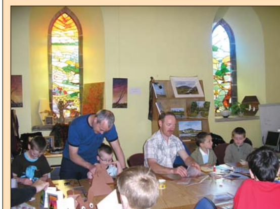
Fathers / Male Carers and children enjoying making Cards