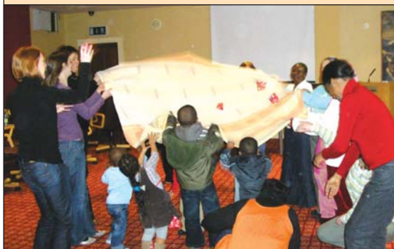
Photo on left Parents and Children taking part in activities at our Parents Seminar

In March of this year the Leitrim County Childcare Committee hosted a Parents Seminar for parents of children 0-6 years on the 1st of March in Carrick on Shannon. The day included workshops on The Importance of Play, Baby Massage and Caring for your Baby. Parents from all over the County took part and all enjoyed the day.