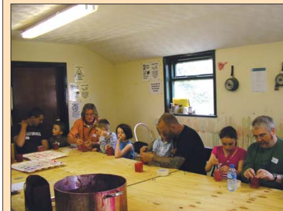
Fathers/ Male Carers and children taking part in the candle making activity

On the 17th of May 9 Fathers / Male Carers and 14 children attended Leitrim County Childcare Committees Fathers Day. This day was held in the Ballagh Center, in Rossinver. Fathers and children enjoyed candle making and designing and making their own cards and everyone went home with candles and cards they had made throughout the day.