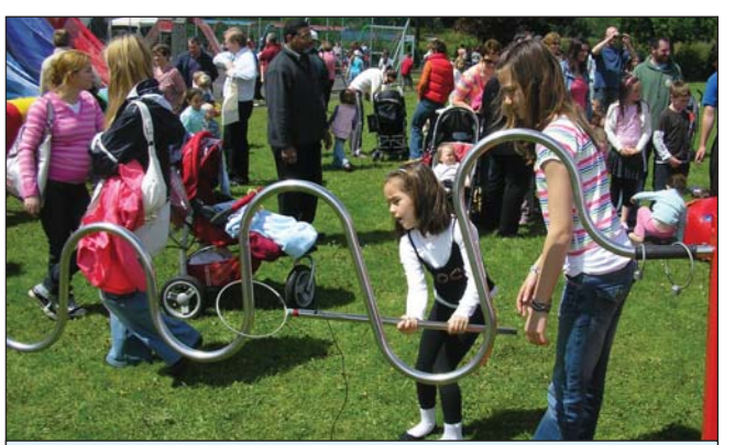
Children taking part in some of the Activities at our Children's Day