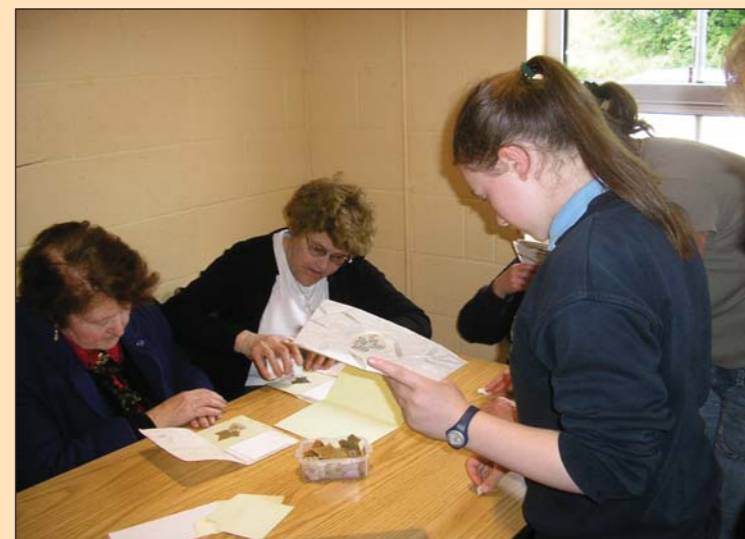
Children from Dowra Afterschool along with the Active Age group in Dowra making Cards

The After school Community Involvement Project was held in Dowra Afterschool in June. A number of members from the local Active Age group joined the Afterschool children and young people in a Card Making workshop. The afternoon was a chance for the younger members of the community to spend time with the Active Age group and all enjoyed the workshop.