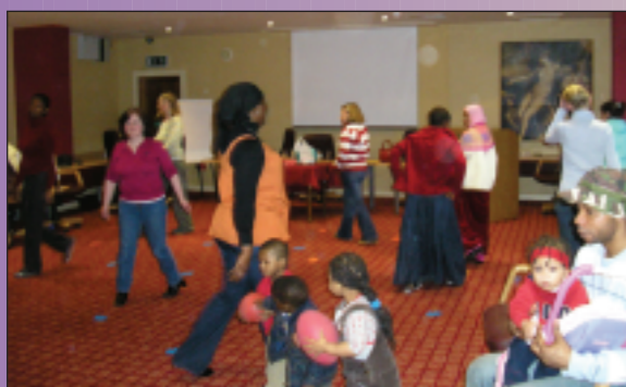
Parents and children enjoying the activities organised during our Parents Seminar