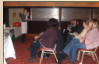
Some of the people who attended the "Food for Families" event.