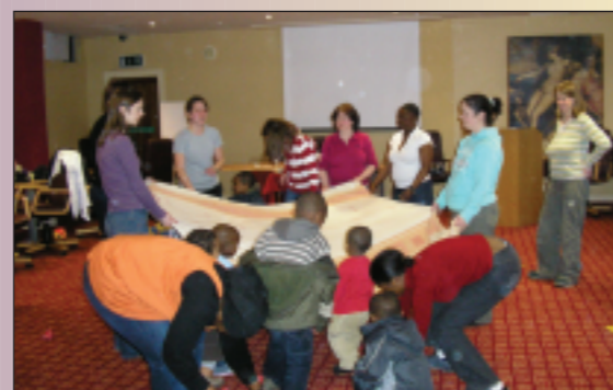
Parents and children enjoying the activities organised during our Parents Seminar