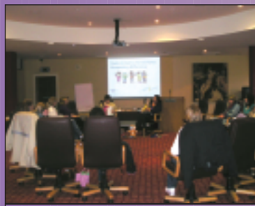
Participants at the Media Initiative for Children: Respecting Difference training

Leitrim County Childcare Committee recently hosted the Media Initiative for Children (MIFC): Respecting Difference. The MIFC was developed by Early Years—the organisation for young children (Northern Ireland) and the Peace Initiatives Institute (Pii, USA). It combines a series of cartoon advertisements with a pre-school curriculum. The aim of the programme is to promote an understanding of and positive attitudes toward those who have similarities and differences, through respect for self and others within the diverse communities of Northern Ireland and the Republic of Ireland.