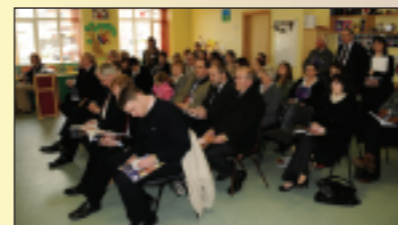
A view of the crowd attending the launch of our Strategic Plan

Minister Smith said that to date over 9.6 million has been allocated in capital and staffing grants to the county, one of the highest amounts per capita in the country. He was 'confident that this Strategy will enable Leitrim County Childcare Committee to continue to develop childcare services within the county.'