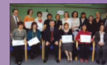
FETAC Level 6 Supervision in Childcare