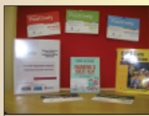
Sample of some of the books available in our resource library

There is a resource library available in our office for parents, providers, childminders and childcare workers in training to access resources to assist them in several areas of childcare and parenting. If you would like to borrow books from our library you can call into the office between 9 am and 1 pm every Friday morning or ring the office to arrange a suitable time. There are a number of new books just in such as "parenting is child's play" by David Coleman, a number of Irish stories with CDs accompanying them for parents, Childcare & Education and Babies and young children, to name a few. A catalogue is available on request.